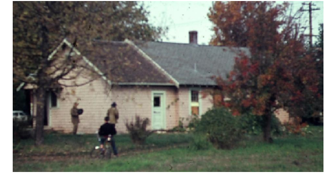
Church Office River Rd & Ferndale