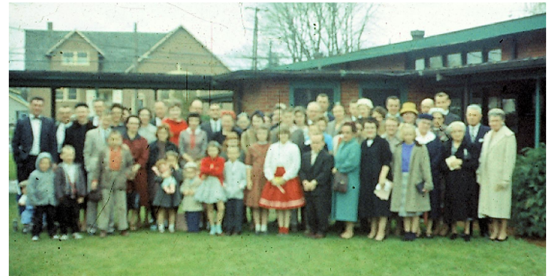
1 st Service @ Santa Clara Elementary [3/13/60]