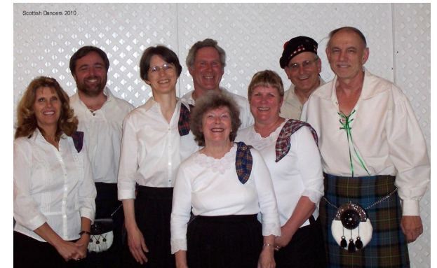
Scottish Country Dancers