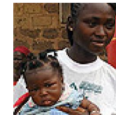
Liberia hosts refugees and thousands displaced from the Ivory Coast