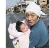
Japan: Responding to the Earthquake and tsunami; helping at evacuation centers