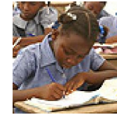
Haiti : Earthquake response continues